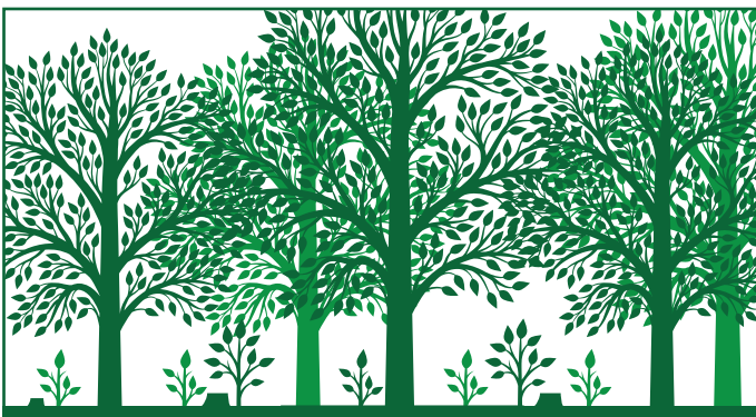
After single tree select harvest.