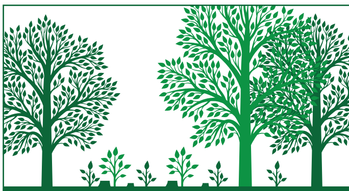
After group select harvest cut.