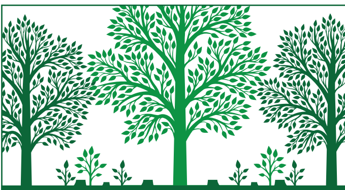
After shelterwood harvest cut.