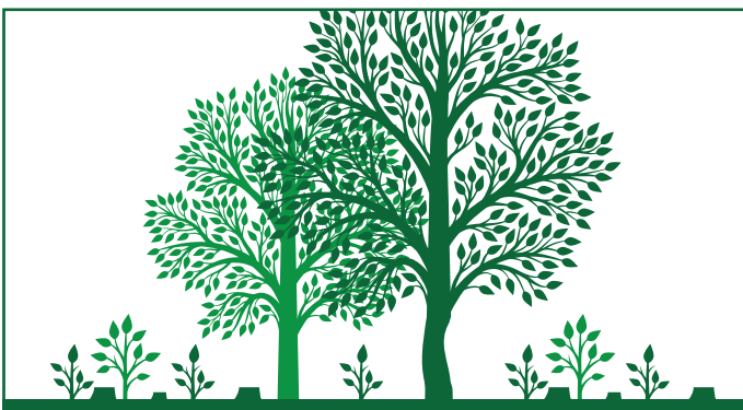
After commercial clear cut or "high-grading".

Call or email one of our professional foresters to learn more about timber harvesting and to request a no-obligation consultation and free property review!